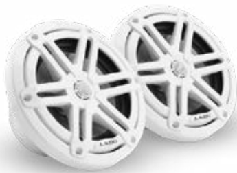
Additional 6.5" M3 speakers 2x