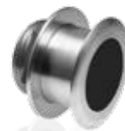
SS60 thru hull 600 watt 50/200 20 degrees