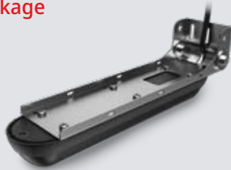
Active Imaging™ 3-in-1