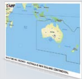
C-MAP® Discover charts for Australia & New Zealand