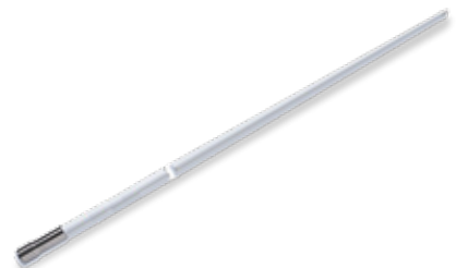
2.4 metre antenna