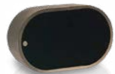
PM275LH-W 1kw pocket mount