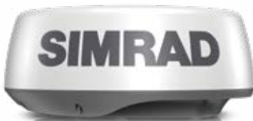
Halo Dome Radar 20 +