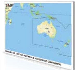
C-MAP® Discover charts for Australia & New Zealand