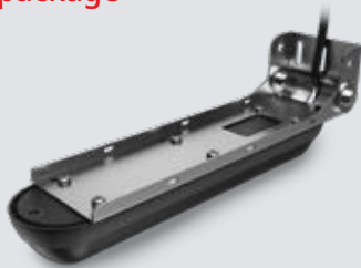
Active Imaging™ 3-in-1