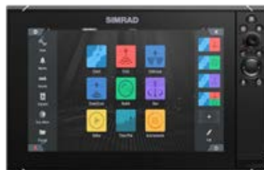
NSS evo3S™ 12 flush mount