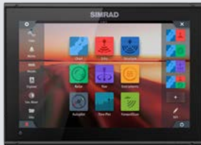
GO™ 12 XSE flush mount