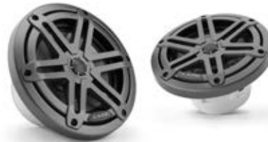
6.5" M3-650X speakers 2x