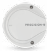
Precision 9 compass