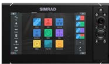
NSS evo3S™ 9 flush mount