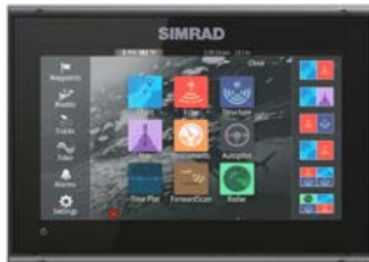
GO™ 7 XSR