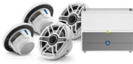
7.7" M6 speakers with 4ch M400/4 amplifiers 4x