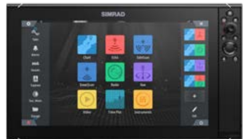
NSS evo3S™ 16 flush mount