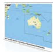
C-MAP® Reveal regional charting options available upon request