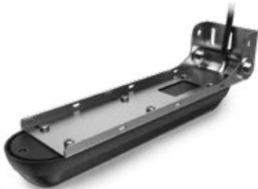
Active Imaging™ 3-in-1