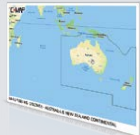
C-MAP® Discover charts for Australia & New Zealand