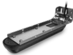
Active Imaging™ 3-in-1 (needed only when NSS evo3S option is selected)