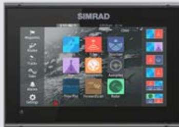
GO™ 9 XSE flush or bracket mount