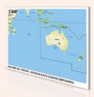
C-MAP<sup>®</sup> Discover charts for Australia & New Zealand